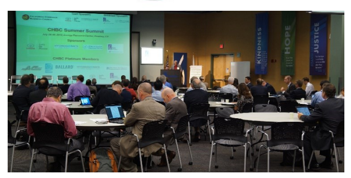
November 24, 2015

The 2016 Program Plan and Budget set ambitious goals for the CHBC at a time when hydrogen and fuel cell technology is becoming a reality in the California marketplace.